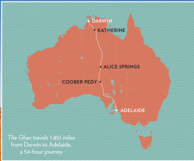
The Ghan travels 1,851 miles from Darwin to Adelaide, a 54-hour journey

It's a gleefully unabashed embodiment of Nebraska's newly minted state slogan: “Honestly, it's not for everyone.” But what tanking may lack in glamour, it makes up for in friendliness: It's an especially social way to float away a summer day, and outfitters around the state offer a variety of trips for all ages. “You're not separated,” says Mitchell Glidden, whose Glidden Canoe Rental runs tanking expeditions on the Middle Loup River. “If it's a larger group, they can trade off and go back and forth into other tanks and visit all the way down that dang river.” —LAURA BEAUSIRE